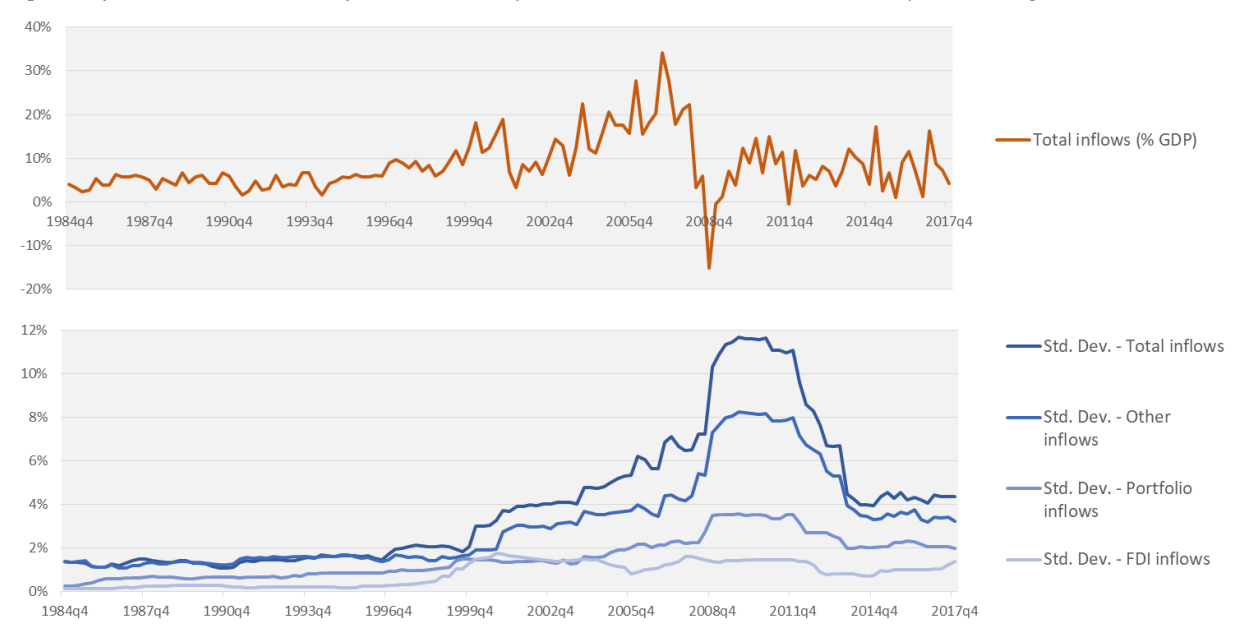
Figure 1: Global capital inflow volatility Capital inflows measured in % of GDP; volatility as the standard deviation over a 5-year moving window

Volatile capital inflows can pose serious challenges to economies. In the past few years, after a period of relatively strong capital inflows, countries like Turkey, Argentina, and South Africa were all buffeted by rapid outflows. Whereas foreign capital can be an important source of growth and investment for countries, it is notoriously "fickle." Just before the global financial crisis (GFC) of 2008-9, cross-border flows, as measured by the IMF's balance of payments (BOP) statistics, reach record heights, only to reverse sharply during the GFC (see Figure 1). Subsequently, supported by low interest rates, portfolio flows – especially from advanced economies (AEs) into emerging market economies (EMEs) – were quite strong over 2010-2012 and 2014-2015. These reversed sharply during the so-called "Taper Tantrum" of 2013 (Eichengreen and Gupta, 2015) and again in 2015 as commodity prices fell and risk sentiment once again flared (Eichengreen, Gupta and Masetti, 2017). In the first few months of 2020, as a result of the Covid-19 pandemic, capital flows to EMEs have reversed even more sharply, even for countries that had borrowed from abroad primarily in their domestic currency (Hofmann, Shim and Shin, 2020).