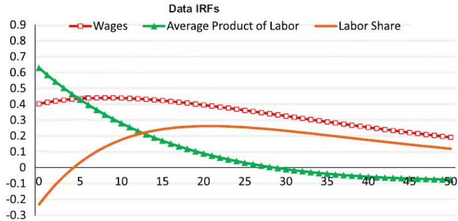
Figure 1: Empirical IRFs of wages, average product of labor, and labor share to productivity innovations in the U.S. Percentage deviations from long run averages.

To account for the response of the labor share to a technology shock displayed in the figure a model should satisfy two desiderata. The first one is that the impact increase in the real wage must be lower than that of average labor productivity. The second one is the presence of a persistent wedge between average labor productivity and real wages, such that the response of the latter is smoother and more inertial with respect to that of the former. The first property implies a countercyclical labor share, while the second one is necessary for overshooting.