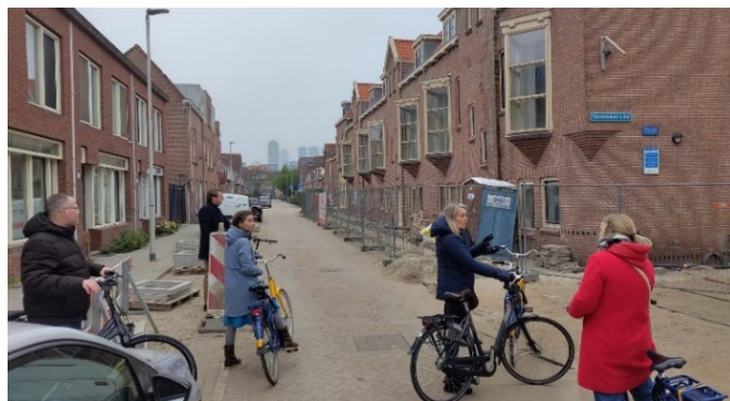
The Bloemhof working group visits the district, end of 2024.

In this progress report, we describe the activities and results for each cluster and for each report recommendation in that cluster. It also includes information on the Bloemhof Rotterdam learning approach and the Climate adaptive business parks pilot in Súdwest-Fryslân, and a new pilot: resilient agriculture in the municipality of Schouwen-Duiveland. For each cluster, we also outline our plans for 2026. In conclusion, we provide a chronology setting out how we join forces with other initiatives.